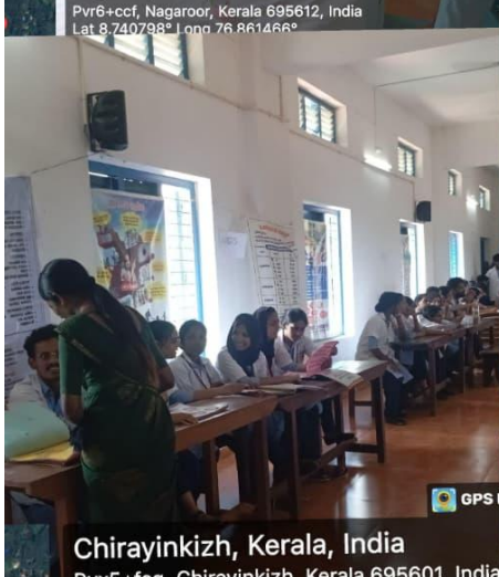
Chirayinkizh, Kerala, India Pvr5+fcg, Chirayinkizh, Kerala 695601, India