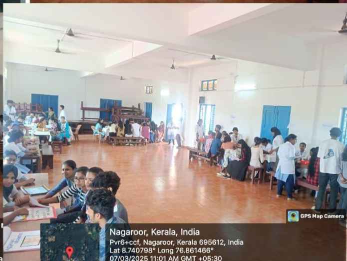
Nagaroor, Kerala, India Pvr6+ccf, Nagaroor, Kerala 695612, India Lat 8.740798° Long 76.861466° 07/03/2025 11:01 AM GMT +05:30