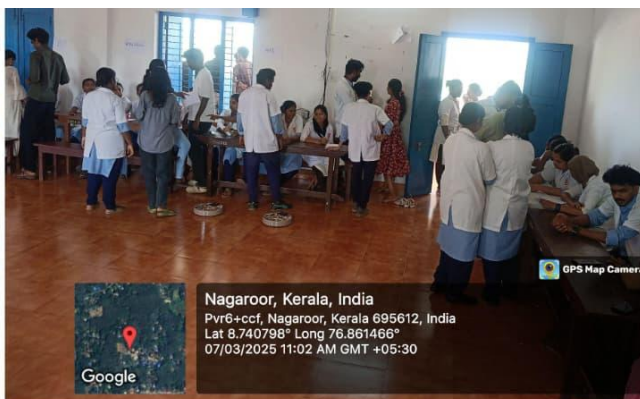
Nagaroor, Kerala, India Pvr6+ccf, Nagaroor, Kerala 695612, India Lat 8.740798° Long 76.861466° 07/03/2025 11:02 AM GMT +05:30